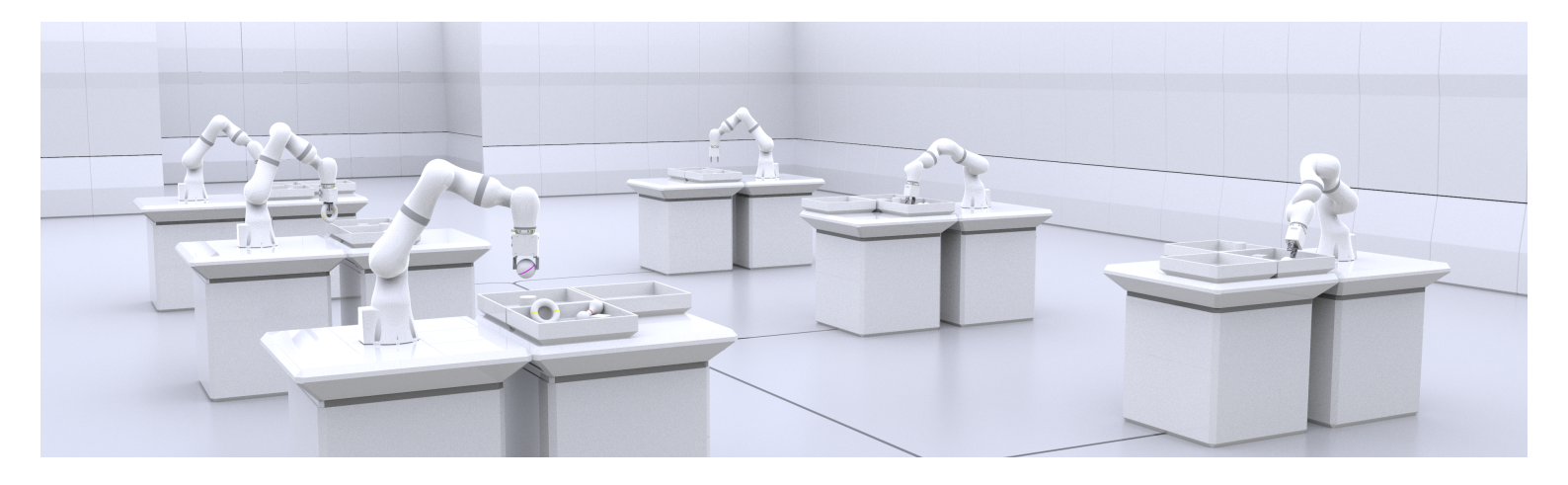
The only simulation platform that enables its users to choose and test the right brain model for their robots.